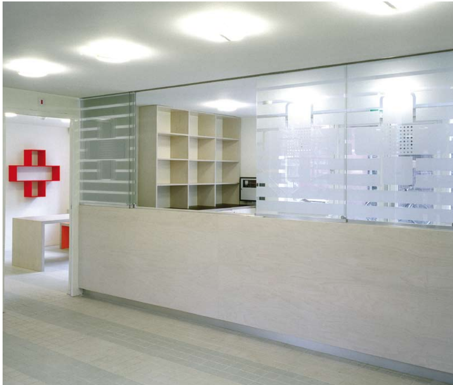
↑ | View to registration area → | View of waiting room from second floor

Address: Nieuwe Haven 171, 2511 XJ, Den Hague, The Netherlands. Client: De DOC GP Practice. Completion: 2002. Gross floor area: 260 m 2 . Medical practice: General medicine.